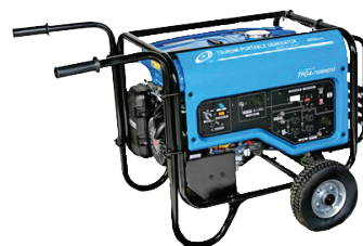
Wheel Kit Special tubular frame with wheels and handles