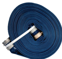
Discharge Hose NPT 2-inch, 50 ft