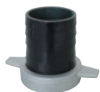
Hose Coupling (with packing)